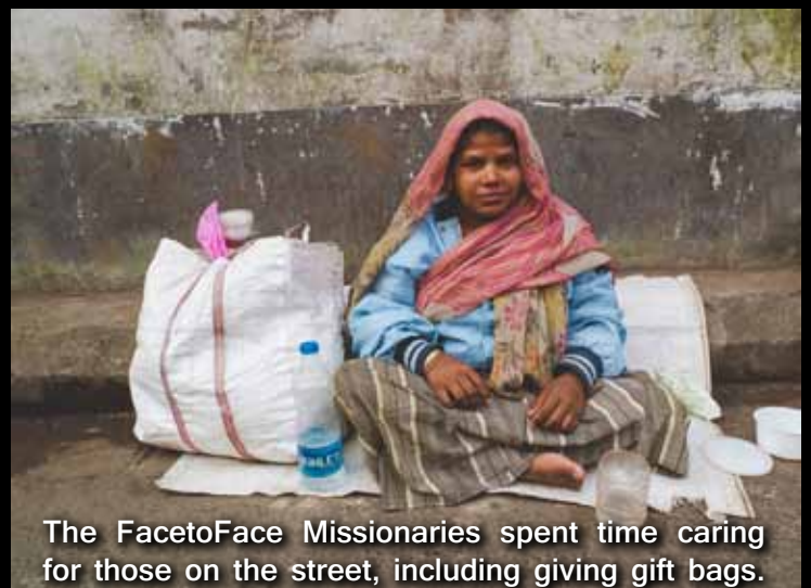
The FacetoFace Missionaries spent time caring for those on the street, including giving gift bags.

Being UNWANTED, UNLOVED UNCARED For FORGOTTEN BY EVERYBODY I think that is a much GREATER HUNGER, A Much GREATER POVERTY Than the PERSON who has NOTHING TO EAT.